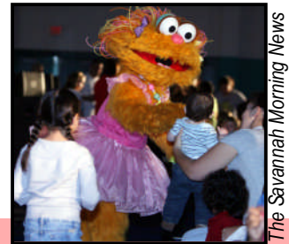
The Savannah Morning News