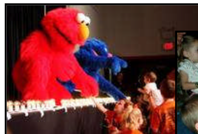
Stars & Stripes