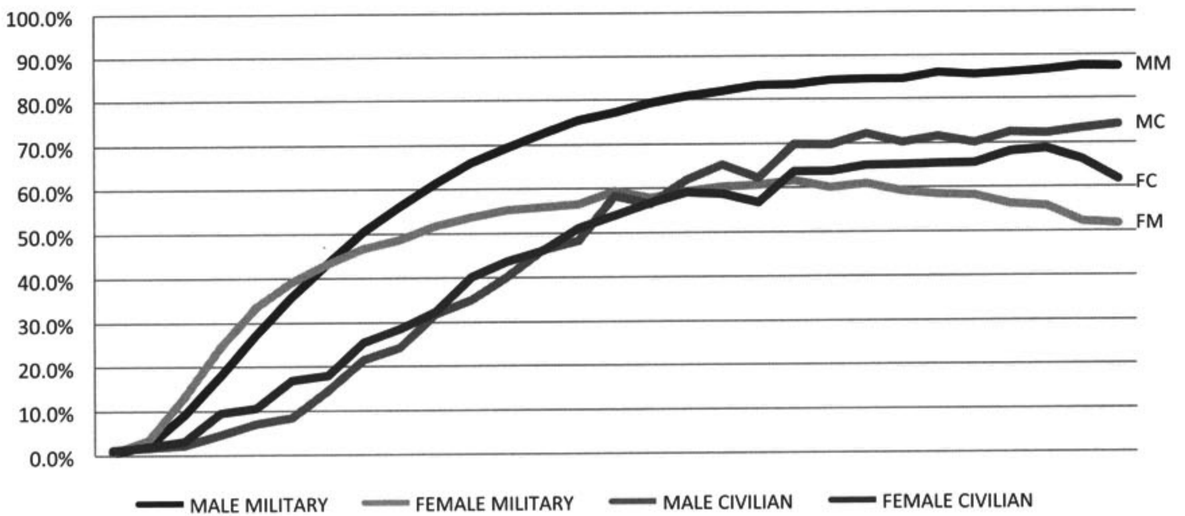
Figure 1. Percentage Married by Age and Gender: Military Personnel vs. Civilians, FY2011

Source: Office of the Secretary of Defense, Population Representation in the Military Services: Fiscal Year 2011 .